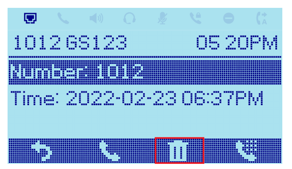
Figure 13: BroadSoft Call Log Entry Details

6. On this page, select the " Delete " button and press the Menu/OK button; then the phone will send a delete request to the BroadWorks sever to remove the call log entry from it. After deleting, the GRP260X phone will update the Call Logs automatically.