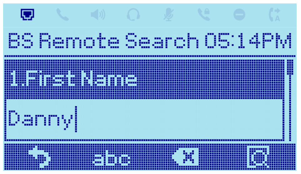
Figure 8: BroadWorks Xsi Directory Search

7. You are able to search the contact entries in Group Directory, Group Common, Enterprise and Enterprise Common Directories. The keyword is case-insensitive. The following figures shows that the user types "Danny" to search the contact whose first name matches "Danny" in the Group Directory. The phone will show the matched results. If the phone displays "No Available Item", it indicates there is no directory entries match the keyword.