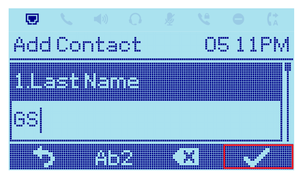
Figure 7: BroadSoft Contact Save to Local Phonebook

7. You are able to search the contact entries in Group Directory, Group Common, Enterprise and Enterprise Common Directories. The keyword is case-insensitive. The following figures shows that the user types "Danny" to search the contact whose first name matches "Danny" in the Group Directory. The phone will show the matched results. If the phone displays "No Available Item", it indicates there is no directory entries match the keyword.