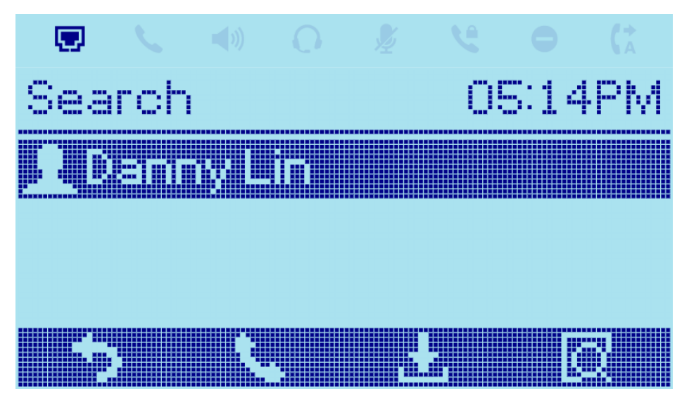
Figure 9: BroadWorks Xsi Directory Search Result